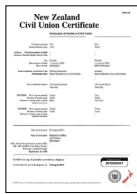
Civil union certificate